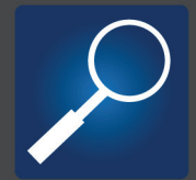
Failure mode analysis